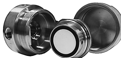
Monel, Hastelloy and Inconel are registered trademarks.

They are suitable for sampling systems and applications to protect analysers and other instruments.